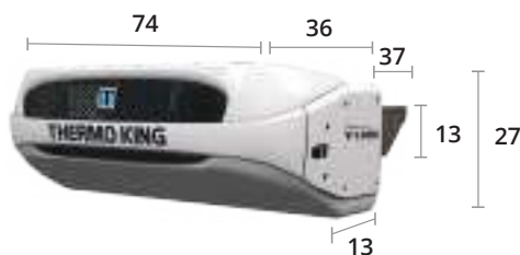
T-890, T-890 MAX, T-1090, T-1090 MAX, T-1090 SPECTRUM